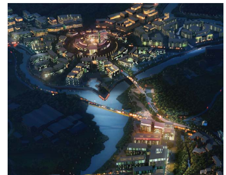
Smart City, Kochi, India