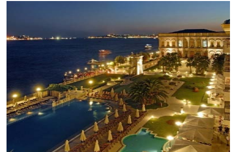
Ciragan Palace Hotel Kempinski, Bosphorus, Turkey

China China China China China Istanbul, Turkey Seoul, Korea Bhubaneswar, India Bilaspur, India India India Saudi Arabia Ras Al Khaimah, UAE Ras Al Khaimah, UAE Dubai, UAE Doha, State of Qatar Jeddah, Saudi Arabia Ulan Ude, Buriyatia Bandon Seri Begawon Young Pyong, Korea Gwachon, Korea Bangkok, Thailand Addis Ababa, Ethiopia Hanoi, Vietnam Erbil, Iraq Salboukh, Saudi Arabia Doha, Qatar Doha Qatar