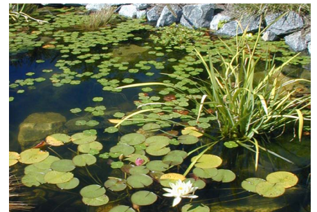
The Korean Ambassador's Residence, Washington, DC