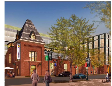
Market at O Street, Washington DC