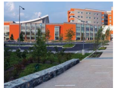
Fort Belvoir Community Hospital, Fort Belvoir, VA