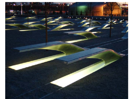
Pentagon 9-11 Memorial, Washington DC