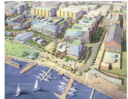
The Yards, Washington DC