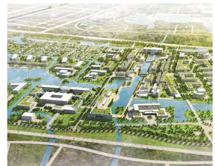
Suzhou International University Research Park, China